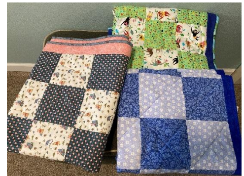
People's Comforters Projects.

We have also been busy working on a group charity quilt that will be donated to Habitat for Humanity. It is a beautiful quilt, and we will keep you waiting on the edge of your seat for a picture until it is finished.