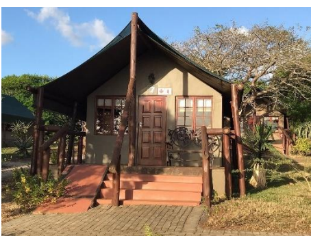
Glamping at Zulu Heritage Lodge.