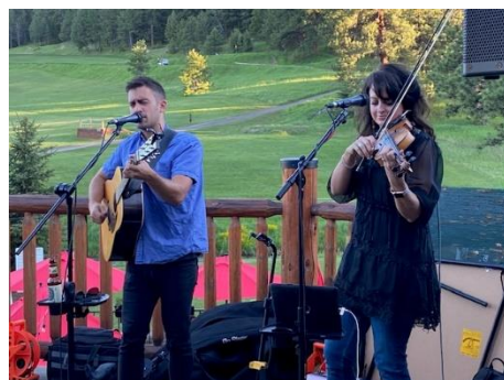
Wirewood Station played the hits and requests all evening