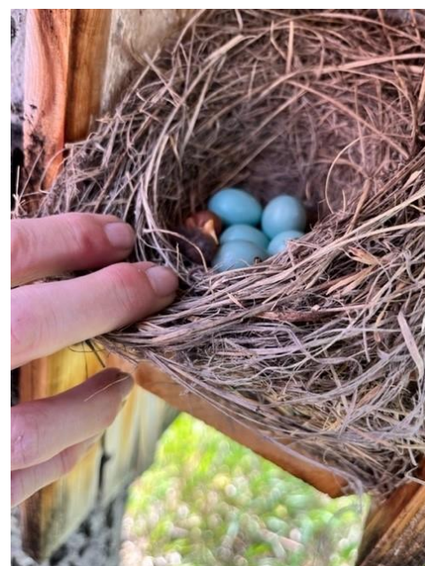
The Nature Hike group checked the bird nest boxes in Elk Meadow Open Space.