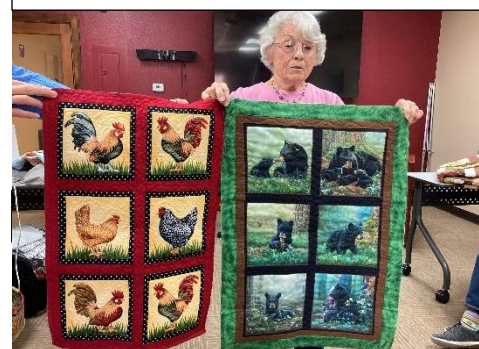
Quilts by Pat.