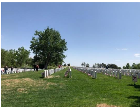
Photos of the flags in place Memorial Day for one week at Ft. Logan National Cemetery.

Flag retrieval at Ft. Logan, occurred with much fewer volunteers, but we got it done in about 90 minutes. Each volunteer retrieved approximately 120 flags.