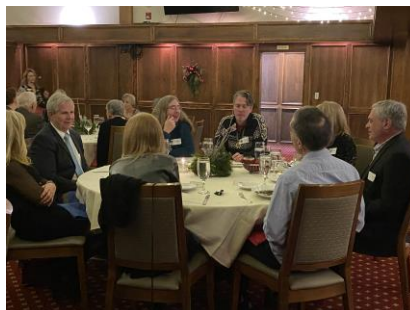
Tables of fun!