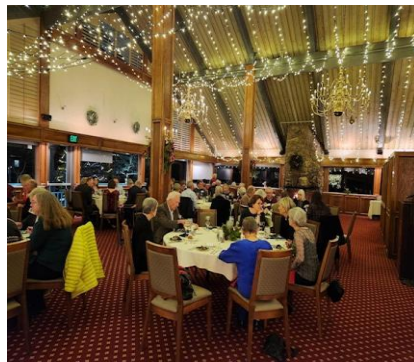
Deck the halls at the Hiwan Room!