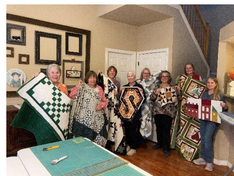
A group photo from our retreat.