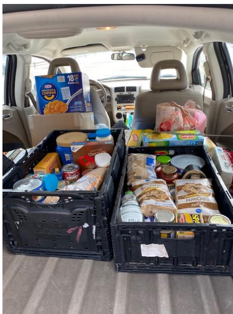
Strategic packing with the many items collected during ENN's annual food drive.