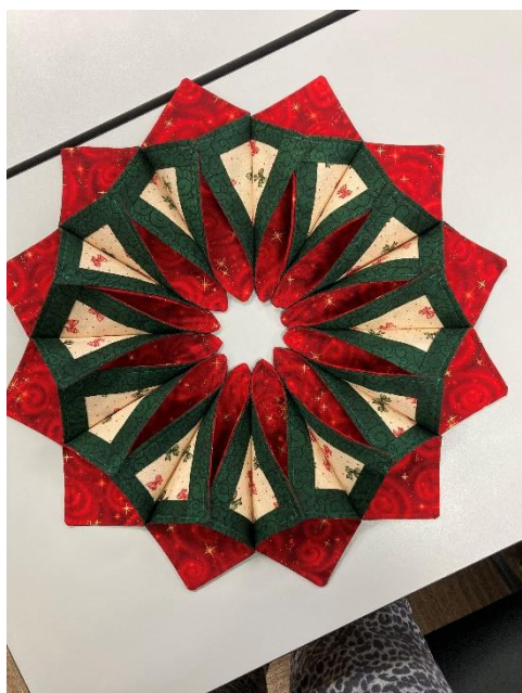
Rachael's Holiday Centerpiece..