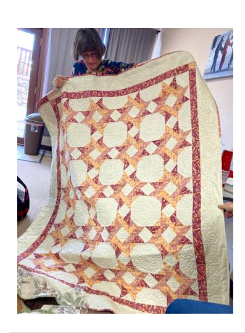
Linda's pink and peach quilt was totally HAND quilted! Unbelievable!