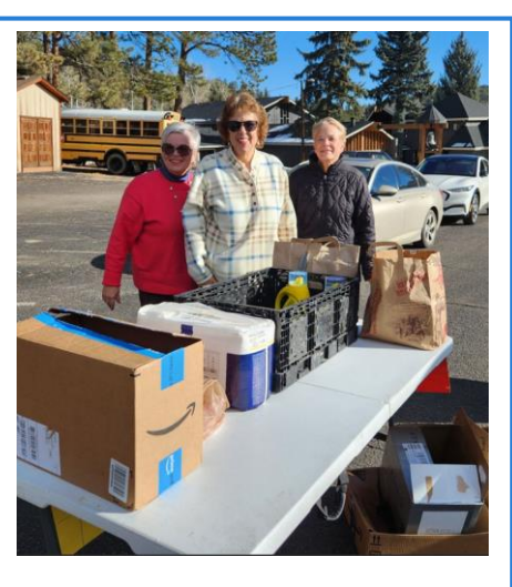
ENN Food Drive moved to Dec. 16.

The fourth annual ENN Food Drive was a great success, even though we had to postpone the date due to icy road conditions. Thank to those members who took their donations directly to ECho.