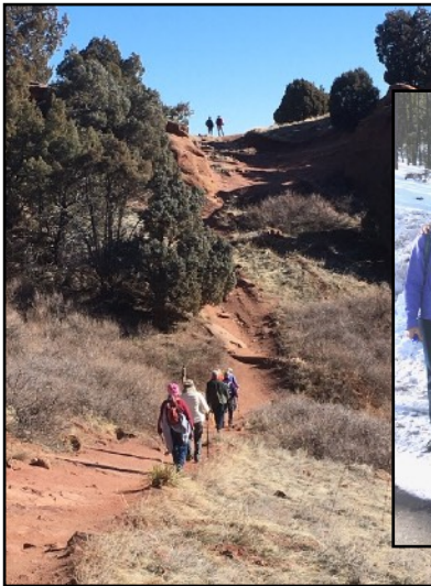
Matthew Winters Park - Jan

If you would like to be added to the Hiking email list for notification of scheduled hikes year round, please contact the leaders at Activities@EvergreenNewcomers.com . They will also be happy to answer your questions about the new and improved format.