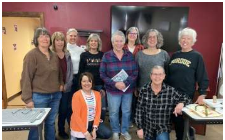
We had an amazing turnout at our last meeting and decided it would be a great time to take a group picture!

In addition to numerous individual projects, we are currently doing a “Block of the Month” quilt – it’s fun to see how differently they all turn out!