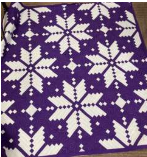
Purple Snowflakes by Kim Bitting