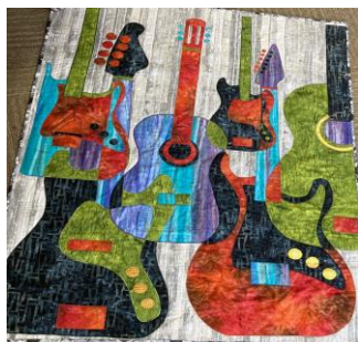
Created by Lynn Robbins