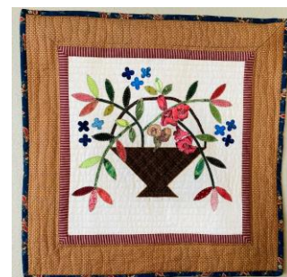
Created By Sandy Illich