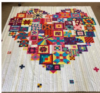
Created By Kim Bitting