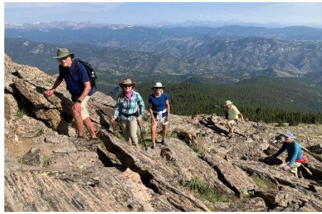
Reaching the top of Chief Mountain, July 2021