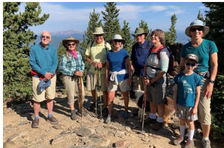
At the top of Chief Mountain, July 2021