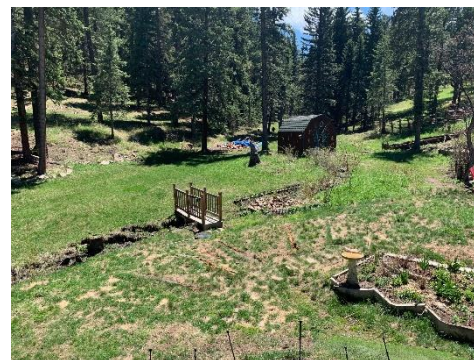
Our "Dog Park, the beautiful yard of Mark and Linda Bolinger.

They currently have five participants and are all having a good time, including the owners. Currently they have a cap of ten furballs due to logistics (parking) but they are hoping to gradually increase their numbers over time.