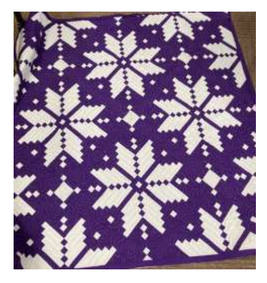
Purple Snowflakes by Kim Bitting